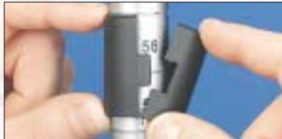
Simply snap together and slide shelf over clips for positive locking.