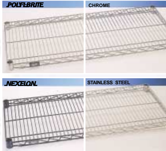
AVAILABLE IN A VARIETY OF SIZES, INCLUDES SHELF CLIPS.