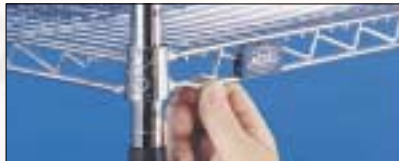
Shelves adjust on 1" increments. Numbered posts for quick assembly