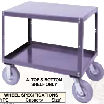
A. TOP & BOTTOM SHELF ONLY

H heavy duty steel frame construction with 14 gauge box formed table top. Three styles and three wheel types (see chart for specifications) to choose from. Open bottom model shipped all welded. Top and bottom shelf model has 17 1/2" clearance between shelves. Available welded or knocked down. Easy assembly. Gray baked enamel finish.