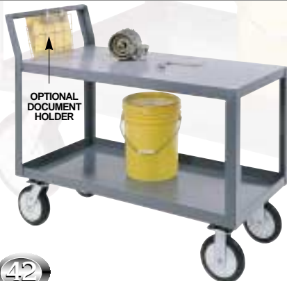
OPTIONAL DOCUMENT HOLDER