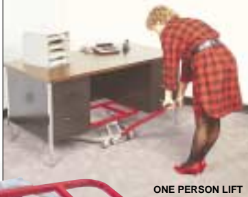
ONE PERSON LIFT