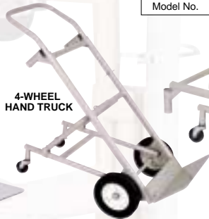
4-WHEEL HAND TRUCK