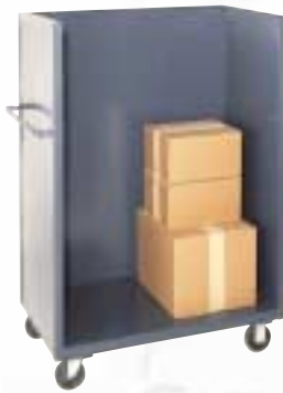
ENCLOSED ON 3 SIDES WITH 1 SHELF

Model NTF1200 Optional Shelf Model NTF51000