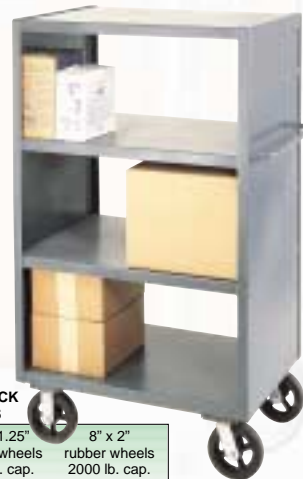
OPEN FRONT & BACK WITH 4 SHELVES

V ersatile, heavy-duty trucks for your warehouse, stockroom, shipping department. Excellent for sorting merchandise, picking orders, transporting goods. Constructed of 18 ga. welded steel with 2 rigid, 2 swivel casters. Gray enamel finish.