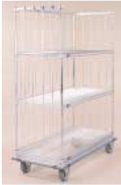
3 SHELF BULK TRUCK DOLLY BASE