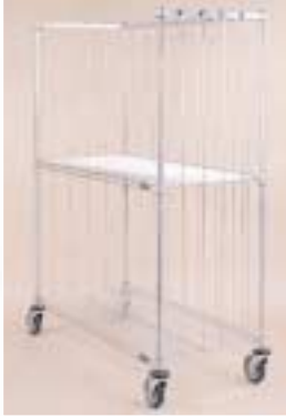
2 SHELF BULK TRUCK