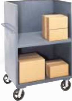
ENCLOSED ON 3 SIDES WITH 2 SHELVES