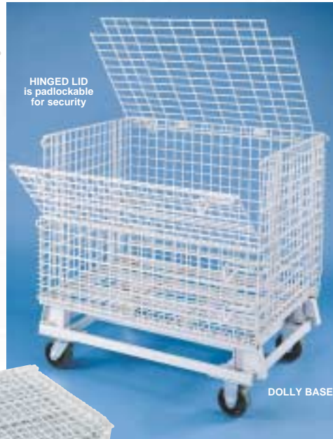
HINGED LID is padlockable for security