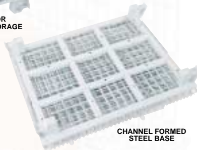
CHANNEL FORMED STEEL BASE