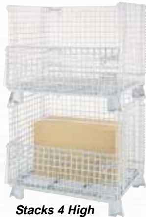
Stacks 4 High

Open mesh construction provides excellent visibility of contents, easy inventory control and eliminates dust and dirt build up. One piece heavy duty folding container features wire mesh arc welded to channel formed steel base. Sides and corners are heavily reinforced. Stacking legs permit handling by forklift or pallet truck; legs are notched to interlock for positive stacking. Add Hinged Lid and padlock for security. Optional dolly base makes your container mobile. Simple boltless attachment includes 5" x 2" polyurethane cast-er wheels, 2 swivel and 2 rigid.